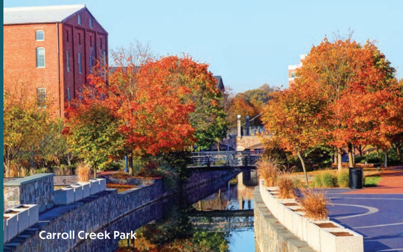
Carroll Creek Park